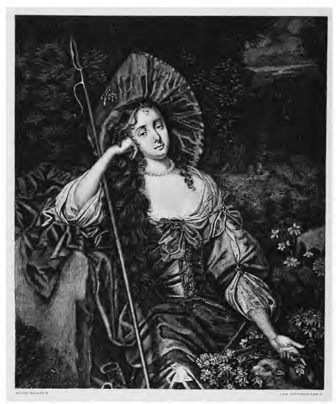
Burbara Duchess of Cleveland and Countess of Castlemaine from the portract engraved by Othersom